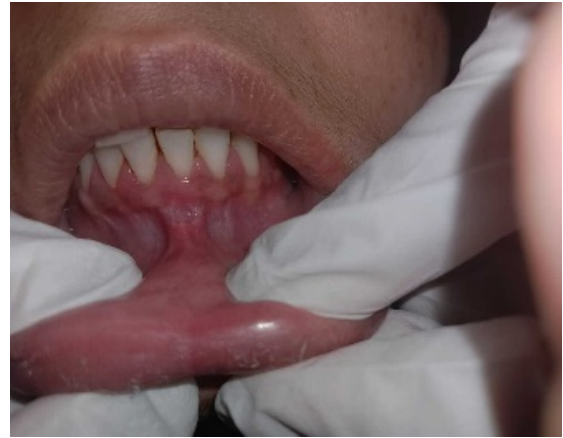
Figure 6: Post 1 week follow up with the reduction in mandibular midline diastema

medication ad vitamin C tablets to aid in healing.