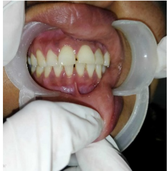
Figure 1: Pre-operative view showing gingival type of Aberrant frenal attachment between mandibular central incisors

with the power setting of 1.5 Watt. Following the excision, the area was covered by the Periodontal pack to avoid any infection of the operated site followed by the prescription of analgesics and anti-inflammatory medications to reduce pain and swelling. I