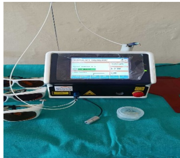
Figure 2: Thermal modality diode laser which is used in frenectomy.

After one week the patient came for the follow up and it was noted that there was a reduction in the black triangle size as well as the spacing between the mandibular central incisors and no further complaint was recorded by the patient except the slight feeling of pain from the operated site for which the patient were further prescribed topical