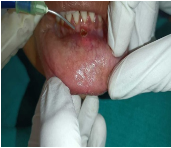
Figure 3: Intraoperative view of excised frenal attachment