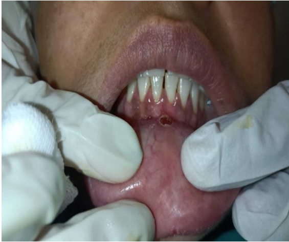
Figure 4: Immediate post-operative view of excised frenal attachment